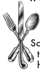
TABLE RESERVATION DAY

Table Reservation Day will be held on Saturday, January 22, 2011 at Fort Myers High School Cafeteria from 8 a.m. to 12 p.m. Members should have received their packets in the mail that contain your membership number and arrival time for this year's table sign-up! In addition to reserving your seats, members will have the opportunity to pay membership dues, join Friends of the Pageant, make reservations for the K&Q Reception and buy Parade Party tickets. Members will also enjoy visiting with friends and sampling a delicious brunch buffet prepared by members. Ball tickets will also be available by calling the Pageant Office at 334-2550 or email Margaret Garner at edisonpageant@centurylink.net .